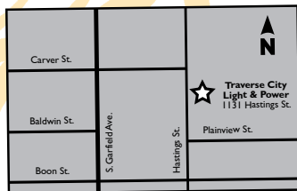
Conservation District Tree & Shrub Sale Location

Place your orders by April 7 by calling the Grand Traverse Conservation District at 941-0960 or order online at www.natureiscalling.org .