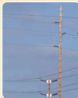
L&P seeks public input on transmission lines and other decisions.