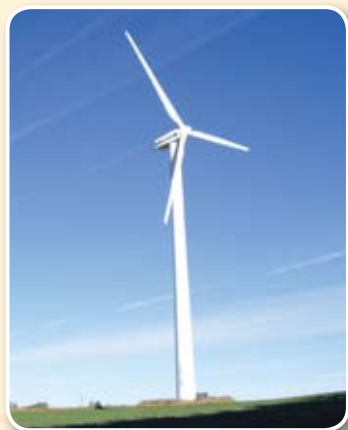
L&P, like other municipally-owned utilities, leads the way in exploring alternative energy sources.